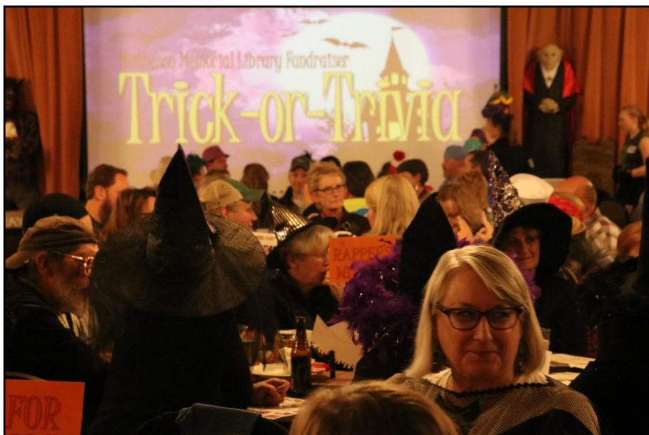
2019 Trick-or-Trivia photos courtesy of Dave Dresdow