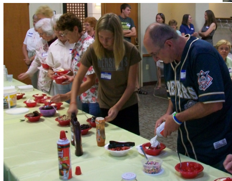
Volunteers make their way through the ice cream buffet (left)